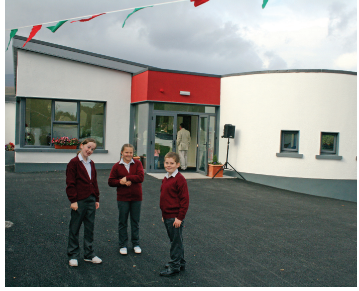
Realth na Mahara National School.