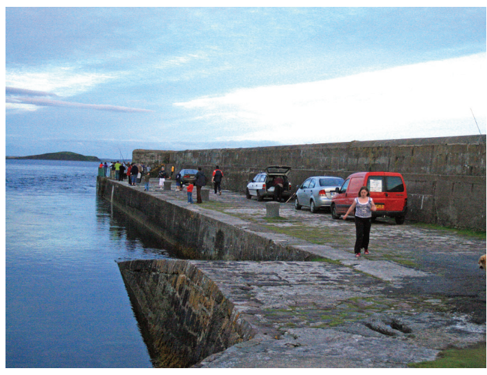
Mackerel Fishing at Mulranny Pier.