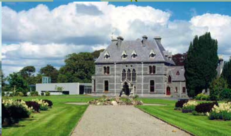
Museum of Country Life