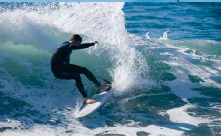
Catching a wave