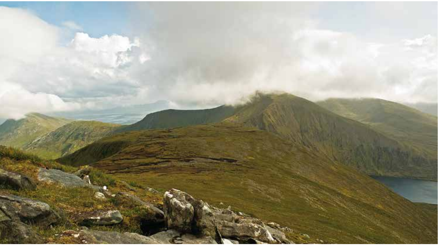
Ballycroy National Park